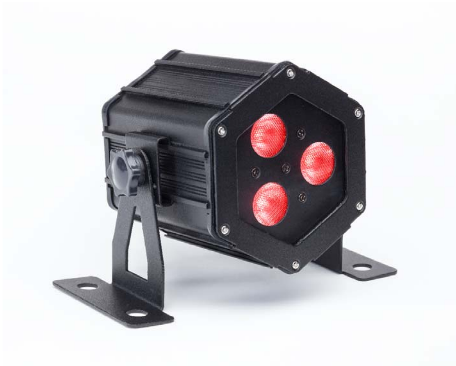
ElektraLite SLA Retina