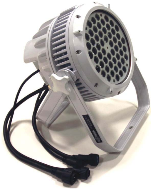
ElektraLite DazerIP65 in white