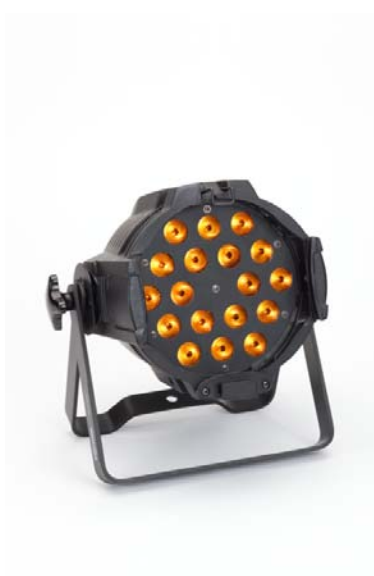
The Elektralite 1018

Using 18 high powered 12 watt leds, the Elektralite 1018 is available using 4-in-1 or 6-in-1 leds. Each led can produce any combination of colors as each led is either an RGBW or RGBWAI device