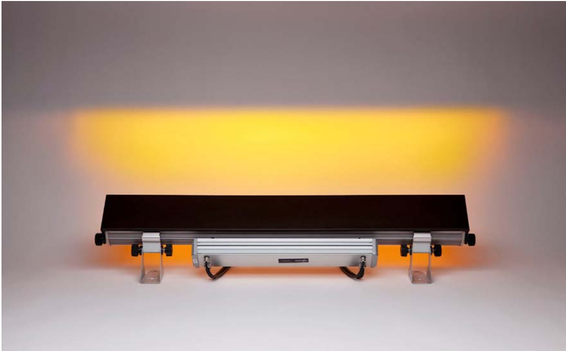
Elektralite Elektrabar with glare shield for perfect cuts

Utilizing homogenized 6-in-1 leds. RGBWAI where the I is indigo (not UV) ; this way perfect pastels like Lee 170 Lavender are flawlessly achieved.